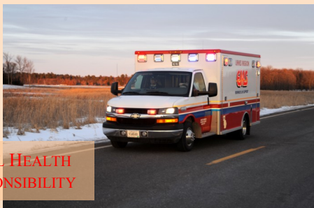
FINANCIAL HEALTH AND RESPONSIBILITY