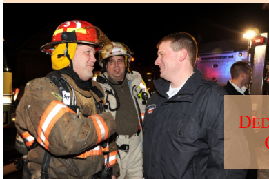
DEDICATION TO OUR COMMUNITIES